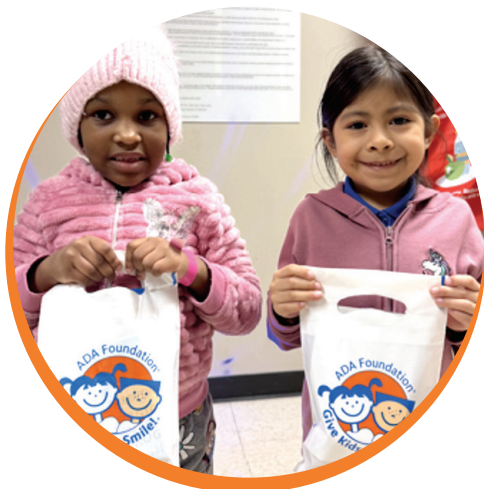
Photo: GKAS 2025, National Kickoff Host, Meharry Medical College, School of Dentistry

According to the Center for Disease Control, cavities are the most common chronic disease of childhood in the United States. Untreated cavities can cause pain and infections that may lead to problems with eating, speaking, playing, and learning. Children who have poor oral health often miss more school and receive lower grades than children who don't.